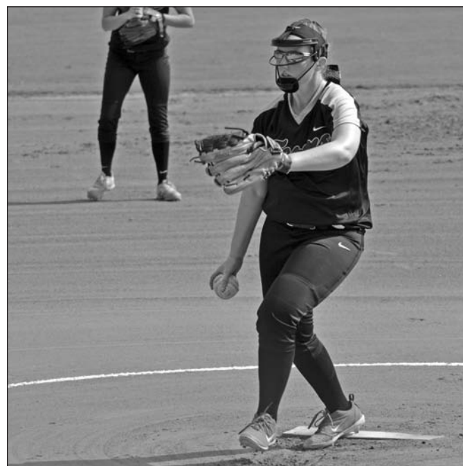
Towns and Commerce were unable to finish due to thunder showers. No make up date is set as of yet.